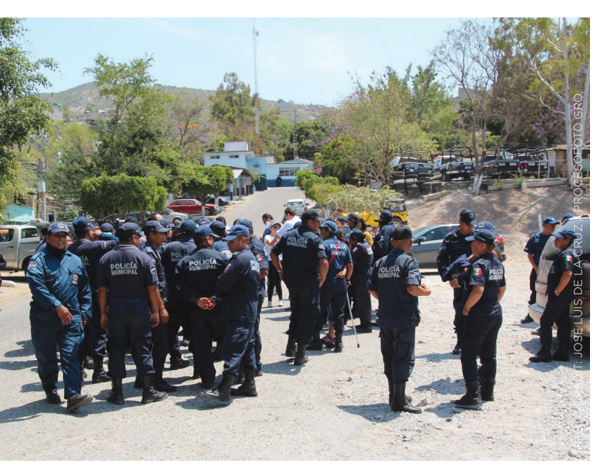
Municipal police in Guerrero State protest, demanding that the results of control de confi- anza exams be made public.

audit by the government's federal auditing agency (Auditoría Superior de la Federación, ASF) as there is little clarity about how the federal government will support police development in the rest of Mexico's municipalities' and ensure their participation in the National Public Security System.