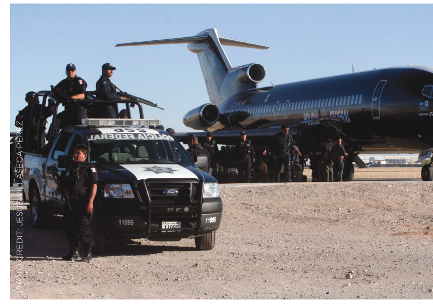
Federal Police sent to reinforce security in Ciudad Juárez.

The Merida Initiative has provided assistance for many of the police reform initiatives described in this report. As of December 2013, the United States' government reported that it had provided "[US]$8 million of training and equipment support to the national vetting program at the state and federal levels" and characterized this system as "a major effort by the GOM[Government of Mexico] to stamp out corruption and build trustworthy institutions."89 In an April 2010 report to Congress, the State Department expressed its intention to provide INCLE funds to increase Mexico's polygraph capability and internal controls, including providing Mexico with 300 polygraph units. Merida funds have also supported Mexico's Police Registry. Approximately US$8.8 million in INCLE funds have been designated to "expand and enhance the Registry and make it available nationwide." The support was primarily for equipment to capture biometric data, hardware to host the Registry, and training of officials in the capture, storage, and retrieval of biometric information.90 As of 2013, the United States had provided training to over 4,500 Federal Police officers on investigative techniques, evidence collection, crime scene preservation, and ethics. State and municipal police have also received training through the Merida