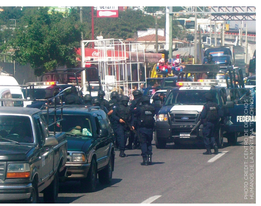
Federal Police officers respond to the student protest in Ayotzinapa, Guerrero, in 2011.

"The agreement committed all parties to adopt and abide by guidelines for the treatment of detainees, especially regarding the chain of custody, detention, and presentation of detainees to legal authorities, as well as on the legitimate use of force."