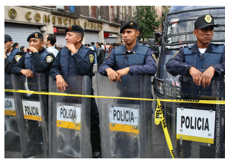
Police presence during bicentennial celebration in Mexico City.

Municipal police make up the largest percentage of the police forces in Mexico, and at this level the Calderón administration began the Municipal Security Subsidy (Subsidio para la Seguridad en los Municipios, SUBSEMUN) in 2008. SUBSEMUN funds are provided to municipalities for the professionalization of public security forces, to improve police infrastructure, and to develop crime prevention policies. Municipalities are chosen based on population and crime rates. Tourist destinations, border cities, primarily urban municipalities, and municipalities that are affected by the high crime rates of adjacent municipalities are given special consideration.31 The Executive Secretary of the SNSP determines the number of municipalities eligible each year. On average, the municipalities receiving support accounted for approximately 64 percent of Mexico's population.<sup>32</sup> For 2012, the last year Calderón was in office, the program's resources were distributed to 239 municipalities in Mexico (out of 2,457 municipalities in the country and 16 boroughs in Federal District). In 2013, 251 municipalities received the subsidy, while 268 municipalities will be receiving the subsidy in 2014.33 SUBSEMUN provided more than US$390 million to municipalities in 2013 and 2014.